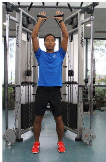
Push the handles upwards using the shoulder muscles. Keep the arms a bit bent at the end.