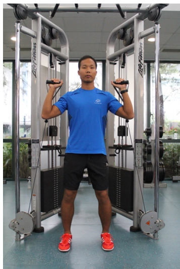
Stand in front of the machine with the hands aligned with the shoulders pointing upwards.