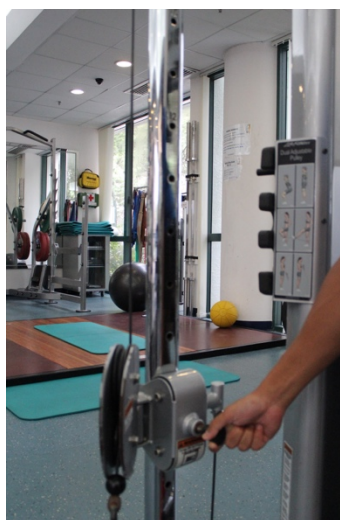
Pull the handle to adjust the pulley to align with shoulders.