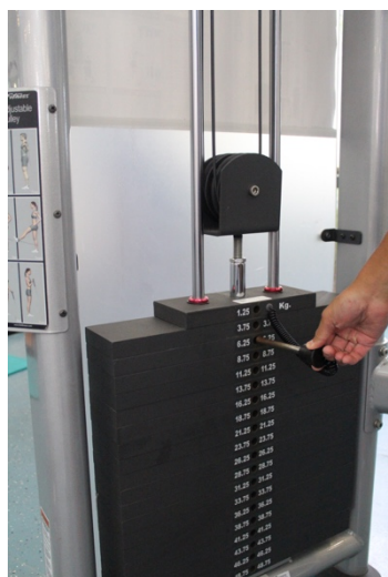
Pull out the handle for adjustment of the weight.